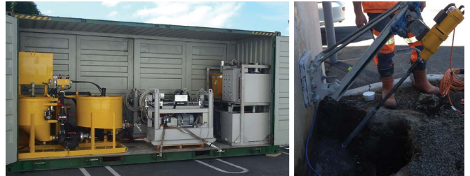
Above, left: Typical JOG site control centre with computer controls, slurry tanks and pumping equipment. Above, right: Angular insertion of JOG injector.

The building was brought back exactly as required with the foundation ground greatly strengthened to better protect the structure from future seismic activity.