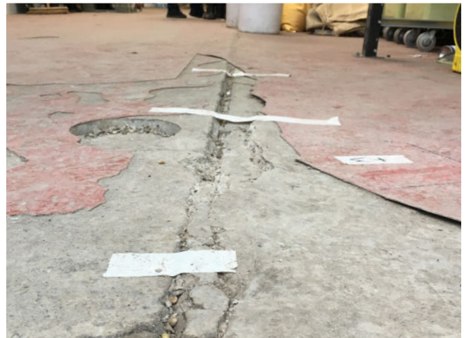
Sloping floor being corrected with JOG and Teretek®

The structure was successfully re-levelled by 138mm within 11 days on site while leaving the neighbouring property unaffected. Both the JOG and Teretek are backed by a 20-year product warranty.