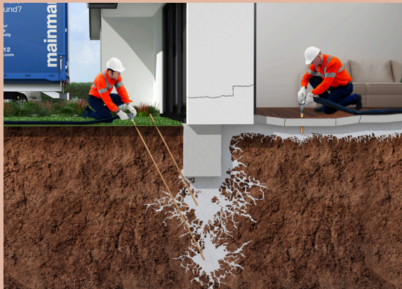
Teretek® engineered resin injection solution